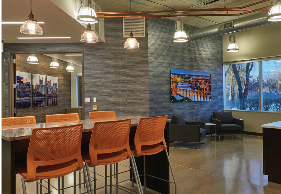
On-site property management and lake view conference center (605)