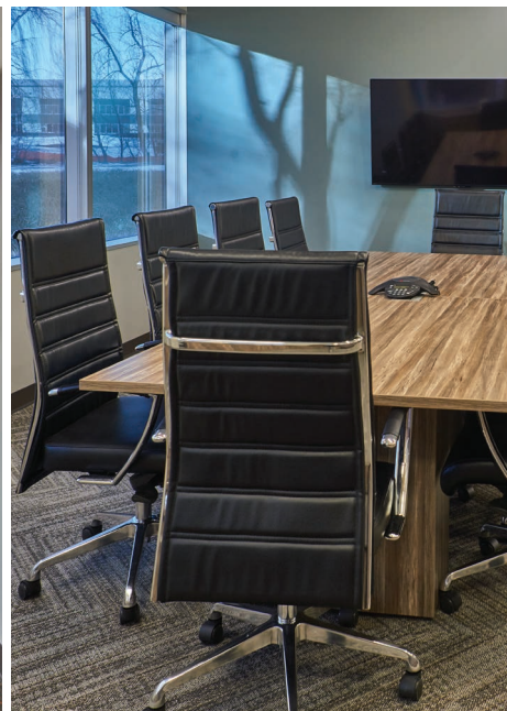
Communal board rooms (505 & 605)