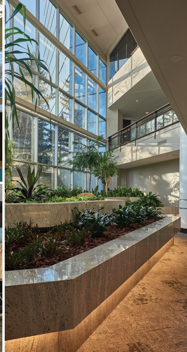
Atrium-style lobbies (505 & 605)

For leasing information, please contact: