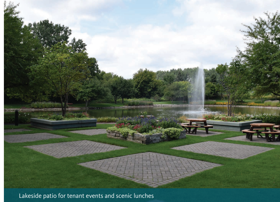
Lakeside patio for tenant events and scenic lunches

For leasing information, please contact: