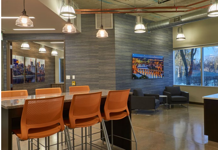
On-site property management and lake view conference center (605)