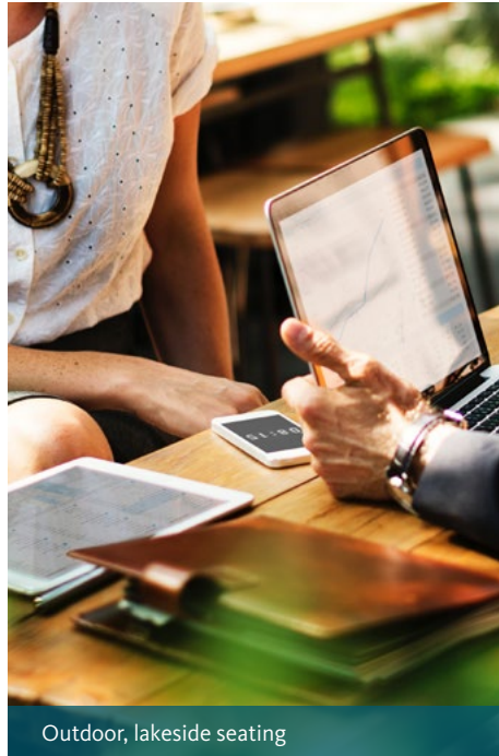
Outdoor, lakeside seating