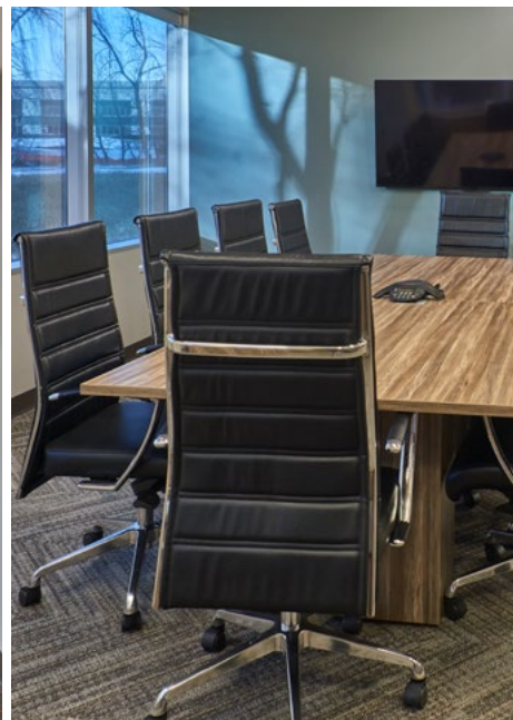
Communal board rooms (505 & 605)