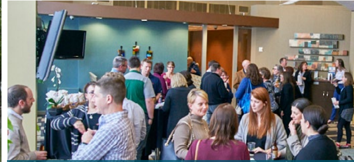
Full-service, on-site café (505) and tenant lounge with grab-and-go snack options (605) and weekly food trucks