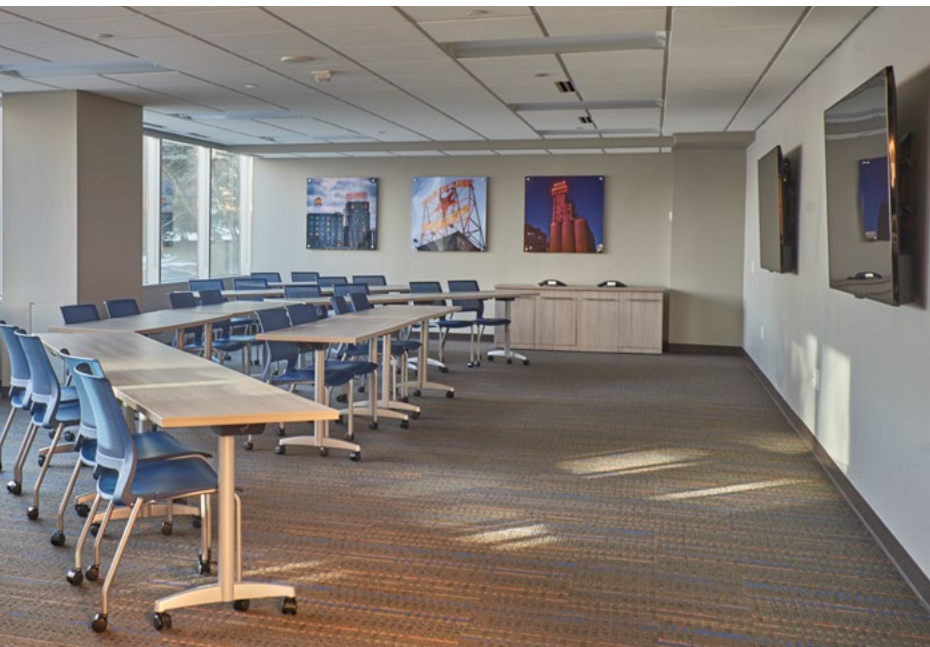
Large complimentary training rooms (505 & 605)