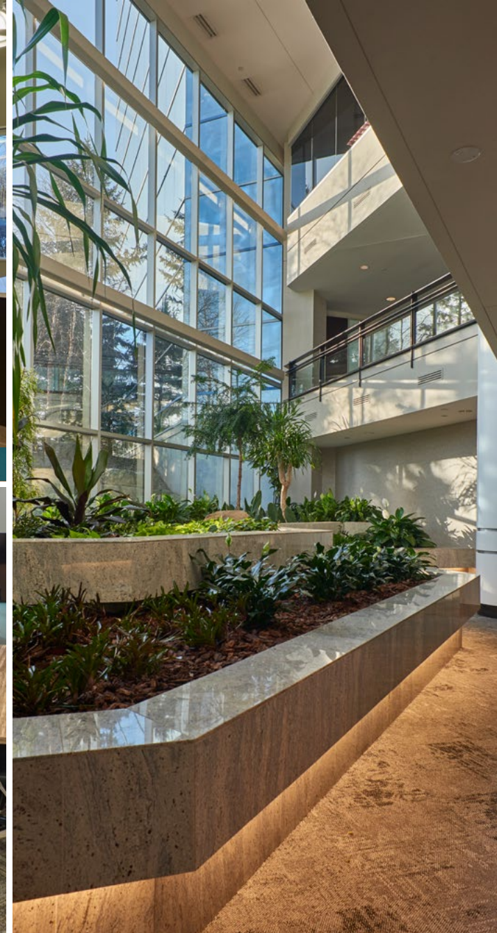
Atrium-style lobbies (505 & 605)

For leasing information, please contact: