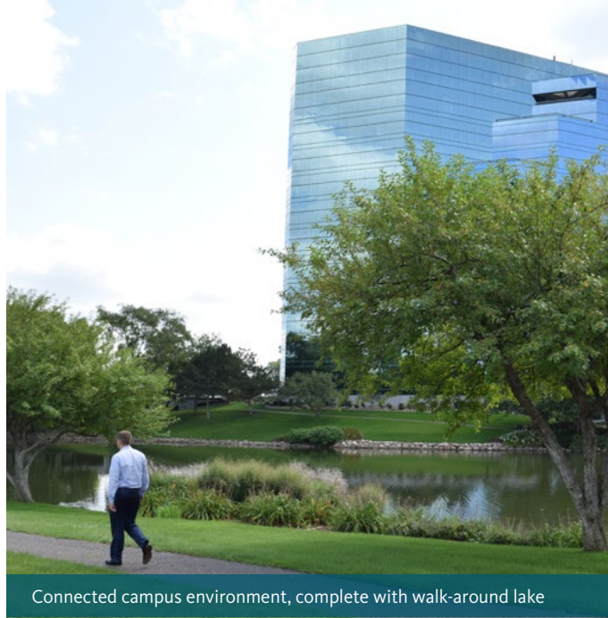
Connected campus environment, complete with walk-around lake

From the Lake View Conference Center and updated fitness facilities to Waterford's attentive on-site property management team — retreat from the every day and discover Plymouth's finest.