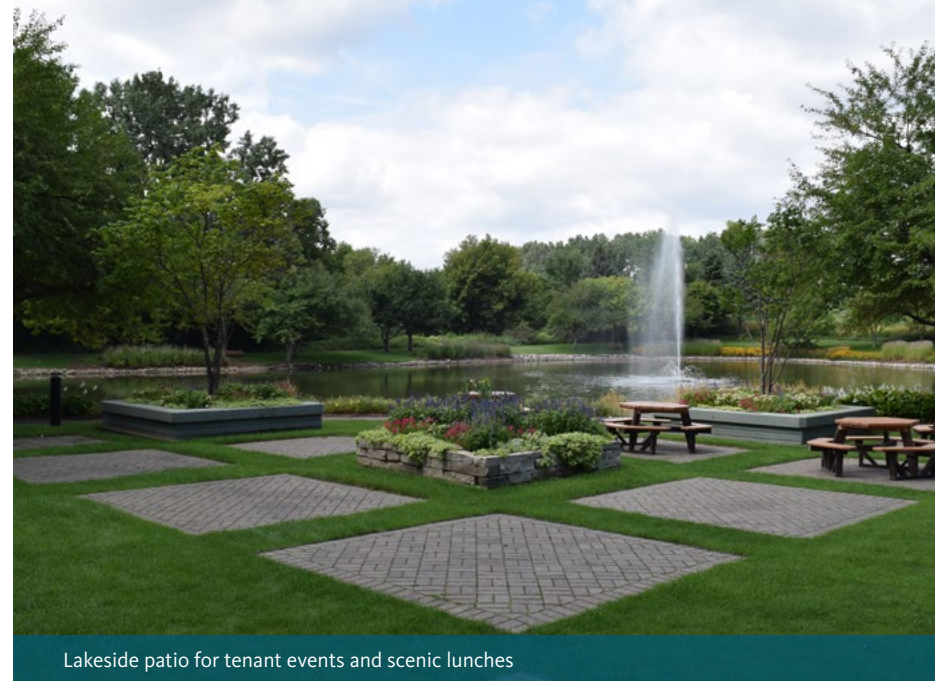
Lakeside patio for tenant events and scenic lunches

For leasing information, please contact: