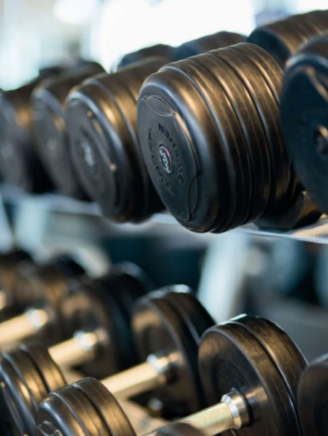
Updated fitness centers with lockers and showers (505 & 605)